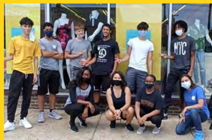
The Exchange Youth Interns