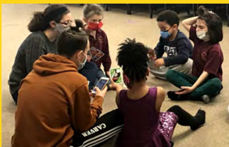
Fun & Support at Learning Pod