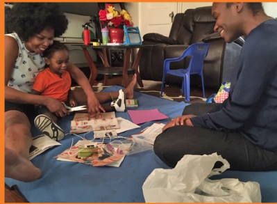
Parents as Teachers (PAT) Early Childhood Literacy