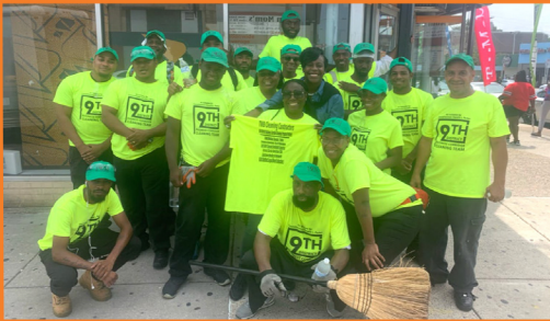
Commercial Corridor Street Cleaning