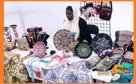
The Exchange Thrift Store Artisan Market