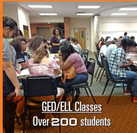
GED/ELL Classes Over 200 students