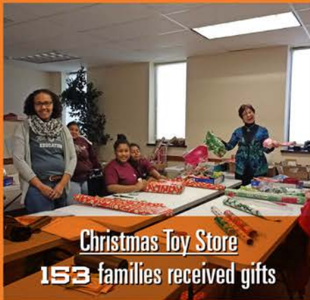
Christmas Toy Store 153 families received gifts