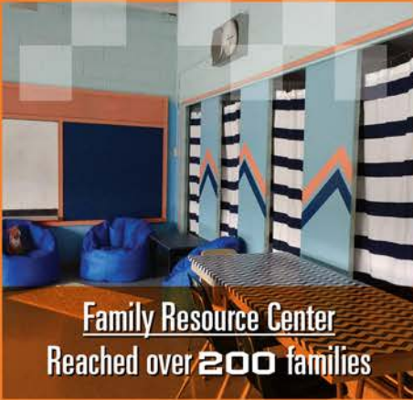
Family Resource Center Reached over 200 families