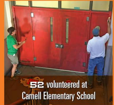
52 volunteered at Carnell Elementary School