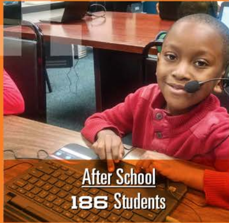
After School 186 Students