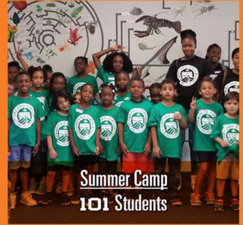
Summer Camp 101 Students